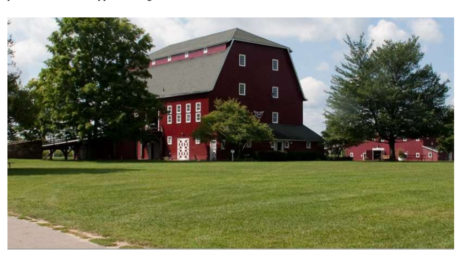
One of the beautiful buildings on the museum campus that contain some of the most beautiful automobiles from history. Bring your E-M-F related car to the Glimore Museum grounds in July of 2023 and join us for the fun!

Model T, or the London Double Decker bus can often be seen traveling