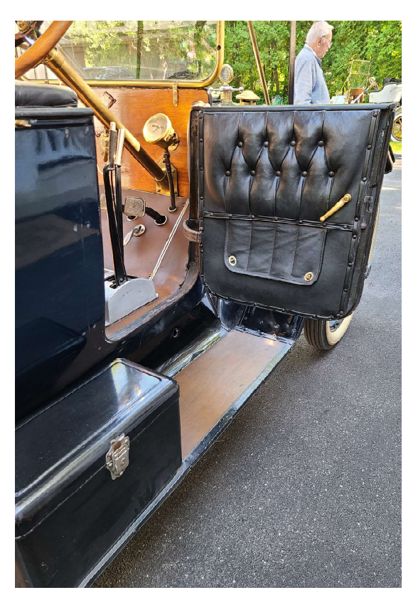
Driver controls and the beautiful upholstery on the doors.