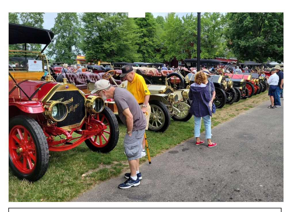
The lineup of 12 Thomas Flyers at the 2022 Celebration of Brass at the Gilmore car Museum. 2022 featured the Thomas Flyer. How about we E-M-F related marquee owners show them how it is done in 2023? Plan now to join us in 2023.